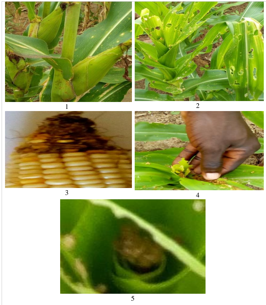
Plate 1: Multiple cob bearing in Oba98, Plate 2: infestation of fall armyworm on leaves of plant, Plate 3: effect of armyworm on cob damage, Plate 4: infestation of fall armyworm on whorl of plant, and Plate 5: armyworm eggs.